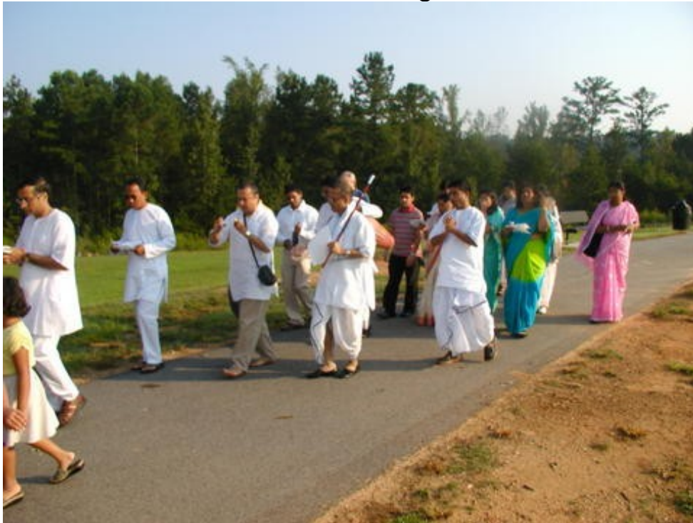
Nagar Kiran by all Satsangees at 1 st National Satsang held at Atlanta, GA