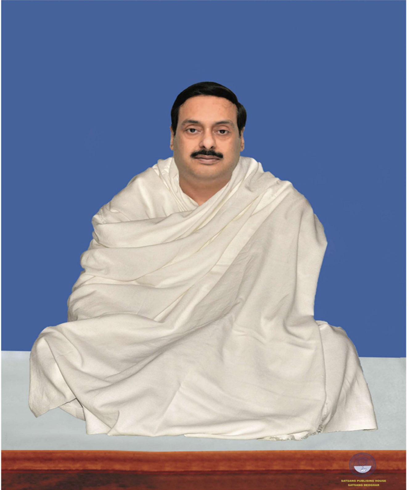
Parampujyapada Sree Sree Acharyadev