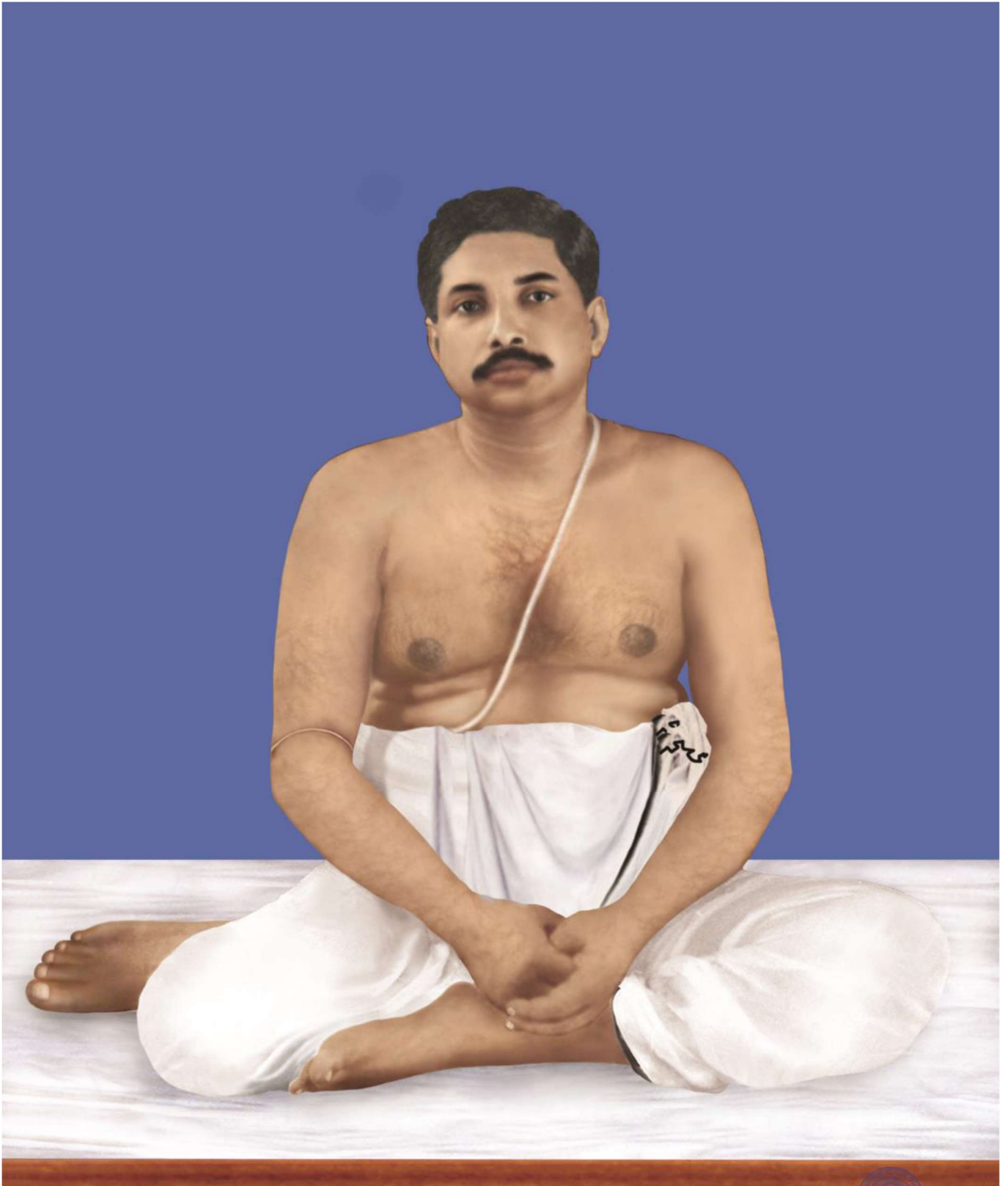
Sree Sree Thakur Anukulchandra